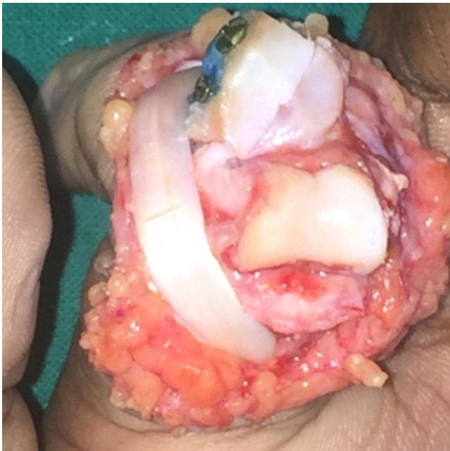
Figure 2. Fixation of the hemi hamate autograft to the middle phalanx of the index finger using titanium screws.