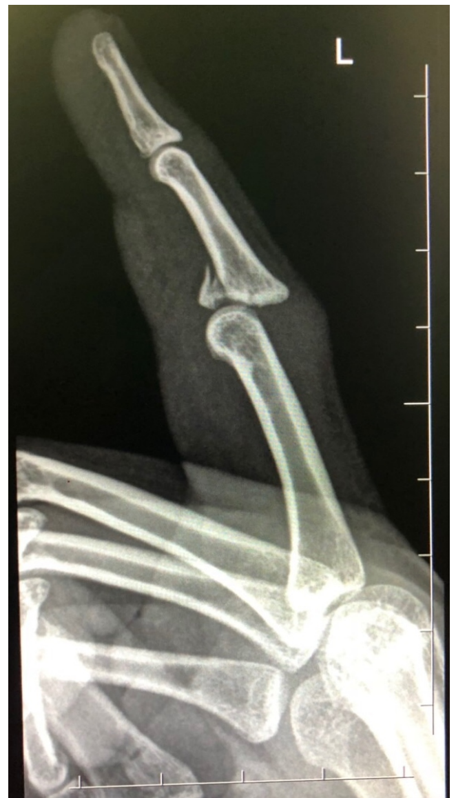
Figure 1. X-ray of the fracture dislocation of the middle phalanx of the index finger

the index to the middle. Both had an uneventful recovery. Screws were removed six months postoperatively in the second patient to achieve further flexion. A ninety-degree flexion of the PIPJ could be achieved after eight months of surgery and the resting pain score measured by the visual analogue scale was zero.