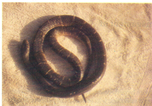
Figure 1 : Common krait ( Bangarus caeruleus ). This specimen was 105 cm long.

mate provide an ideal habitat for snakes (1,2). Common victims of Bangarus caeruleus are farmers who live in open wattle-and-daub houses and farmers sleeping in watch huts in agricultural fields. A significant number of patients die before reaching a hospital. Surveys carried out in 1983 in Anuradhapura district (1,5) have shown that Bangarus caeruleus bites accounted for 45% of 110 deaths in the field due to snake bites. However, in recent years more patients have sought the life saving benefits of hospital treatment. The aim of the study was to gain a proper understanding of the clinical and epidemiological aspects of common krait bites and to develop a policy of management in the intensive care setup, based on the prospective observations.