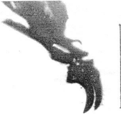
Fig. 3: Cephaloskeleton of the 3 rd instar larva of "Tumbu fly", Bar = 500µm

The cephaloskeleton was dissected and this and the posterior spiracles were mounted in Depex after standard fixing, dehydration and clearing procedures. The labial sclerites of the cephaloskeleton are long and curved (Fig. 3). The peritreme of the posterior spiracles is only faintly sclerotised and the slits slightly sinuous giving it a question mark (?) appearance while the button is indistinct. The larva was identified as a 3 rd instar larva of C. anthropophaga .