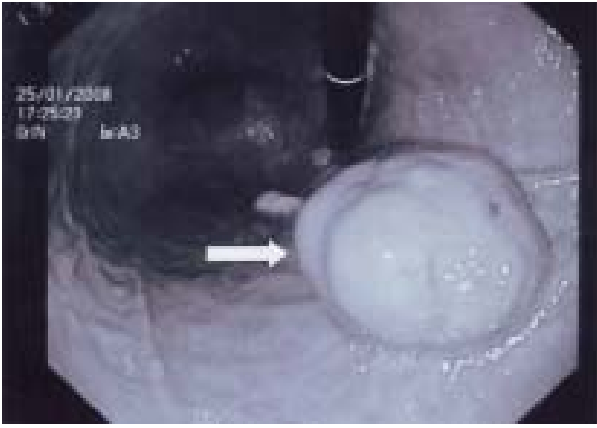
Figure 1. OGD view of the sessile growth (arrow) in the body of the stomach.